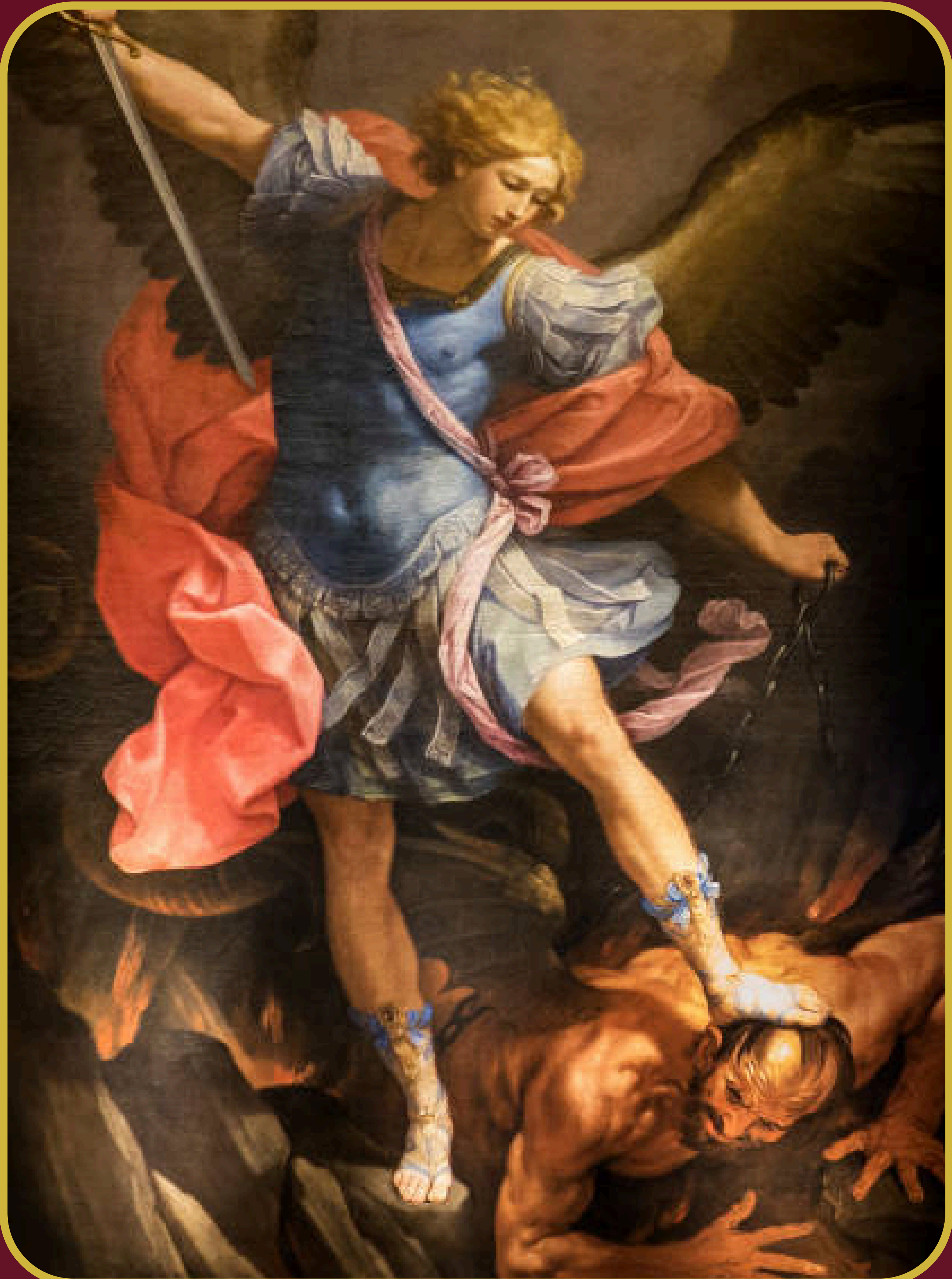
Archangel Michael defeating the devil